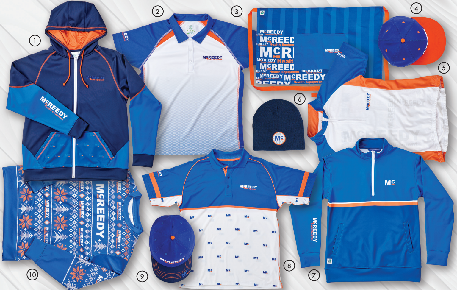
1.) FSP2351 2.) FSP200 3.) FSP3000 4.) 777QD 5.) FSP2010 6.) 1000QD 7.) FSP2700 8.) FSP800 9.) 774QD 10.) FSP2500

FOR MORE INFORMATION CONTACT YOUR ACCOUNT MANAGER TODAY